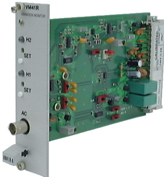
Vibration Monitor 10 channels

When needing to monitor multiple points. VM41 Rack system can measure up to 10 measuring points simultaneously. Alarms, relays and mA outputs are standard.